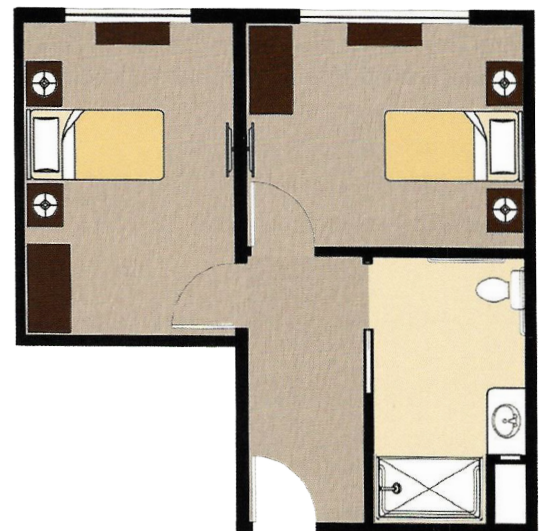
SHARED SUITE 445 sq ft